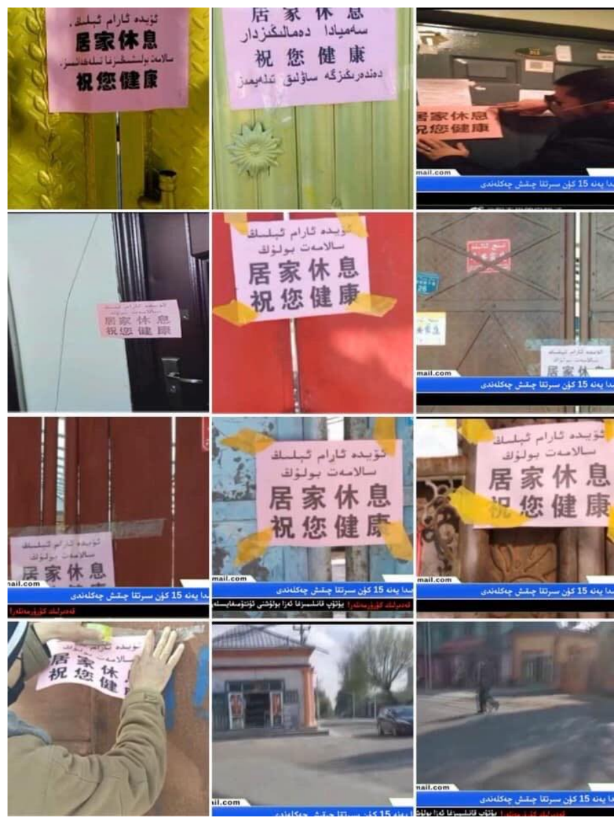
Image: Uyghur-, Kazakh-, and Chinese-language seals, the text of which exhorts residents to "Rest at home and be healthy," placed over the cracks in doors to local residents' homes.

Authentication : Language on the printed seals tracks typical government phraseology and style. Our analysis of the photos reveals no earmarks of digital alteration. Other photos posted on social media show <u>seals printed with similar messages</u> in multiple languages, including the Arabic-script Uyghur and Kazakh used in the Uyghur Region.