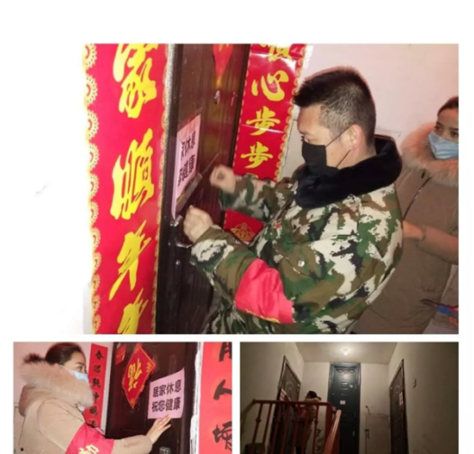
Image: Screenshot of blog post "Xinjiang: a place you can't leave once you're here."